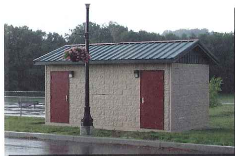
Ohio Purchasing Plan